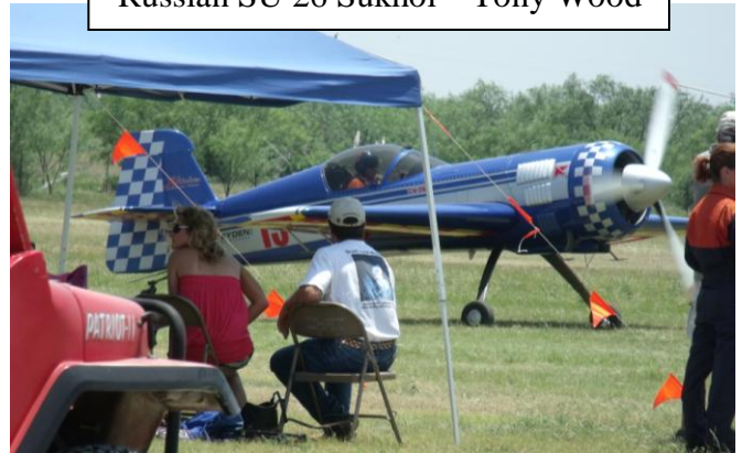
Russian SU 26 Sukhoi