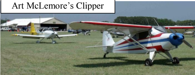
Art McLemore's Clipper