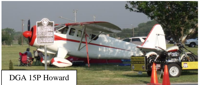
DGA 15P Howard